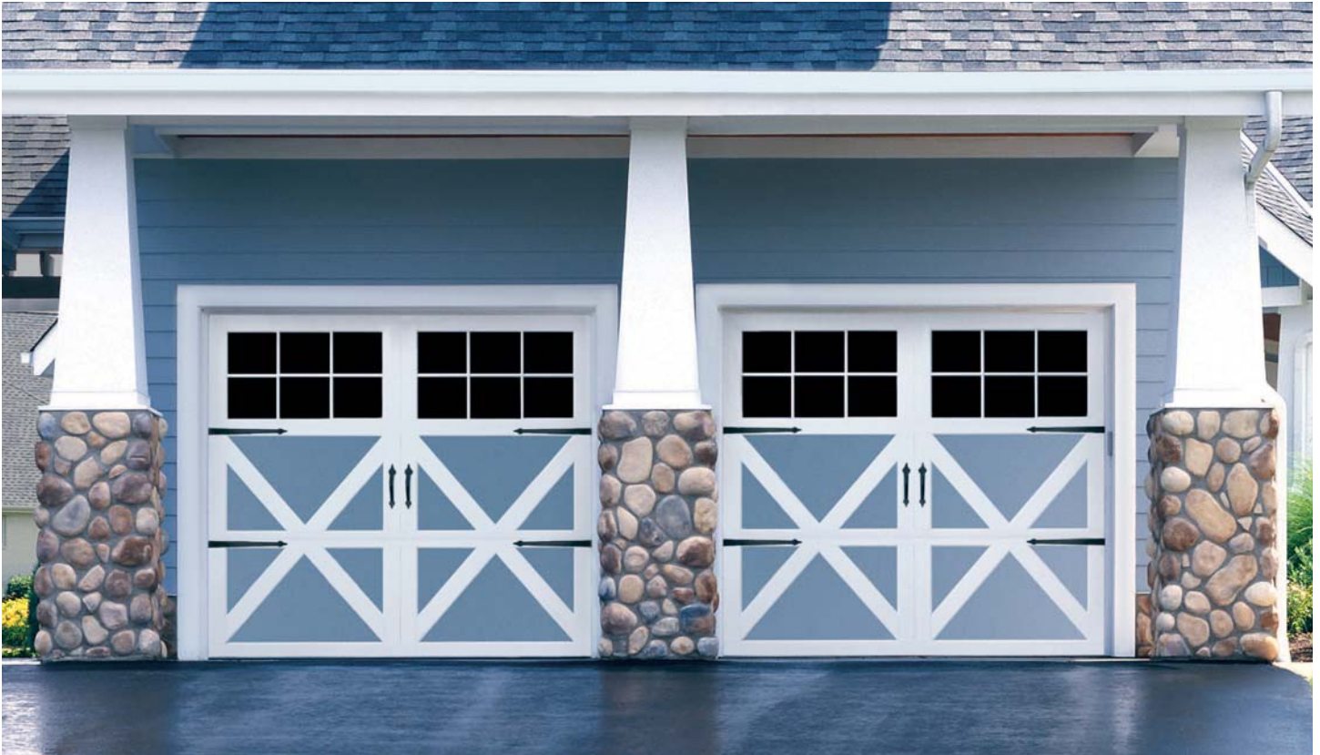
Model 9700 shown in Lexington design with 12 window square and optional decorative hardware